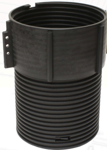
P NM Extension

Height Range: 1"-39" Base Diameter: 8" Head Diameter: 6" Tab Height: 1/2" Tab Width: 5/32" Load Capacity: 3,300 lbs LEED Certified